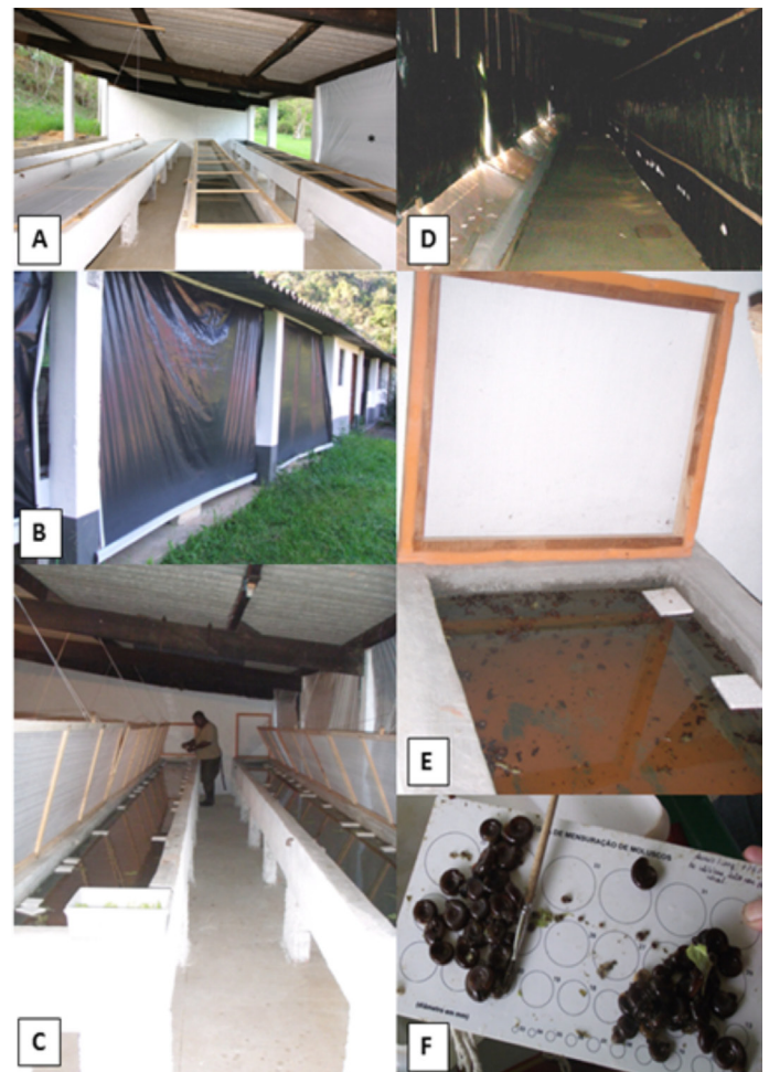
Fig 1 - Breeding of B. tenagophila in mass scale at the “Chácara Santa Inês”, Bananal/SP. A: New facilities for breeding of B. tenagophila (Taim lineage) (inside view). B: Obs.: Breeding of B. tenagophila from Taim (outside view). (.)The canvas is black on the outside and white inside. C: New facilities for breeding B. tenagophila (Taim lineage) on a mass scale, showing the system for opening and raising the covers of the breeding tanks and showing protection for the tanks by means of black canvas for temperature maintenance through greenhouse effect. D: The former facilities for breeding B. tenagophila (Taim lineage), showing protection for the tanks by means of black canvas for temperature maintenance through greenhouse effect. E: Tank for breeding B. tenagophila (Taim lineage) showing the snails, the bottom covered with earth, and Styrofoam plates for catching the spawnings. F: Measurer used to assess the growth rhythm of B. tenagophila (Taim lineage).

The temperature of the tanks is controlled by covers made of canvas (black on the outside and white inside) which are used in sheds designed for breeding chickens. These covers are not used during the hottest months, but in winter they are ringed down in order to protect the whole tank area. These canvas covers keep and concentrate the heat from the sun by green-house effect, which allows the water temperature of the tanks to be controlled between 20 to 24 °C; this is especially important during the coldest months. There are two types of lighting: natural lighting when the covers are raised, since the tanks get a direct light from the sun; and an artificial one using fluorescent lamps, mainly when the covers are ringed down during the winter period or at night, when necessary (Fig. 1D).